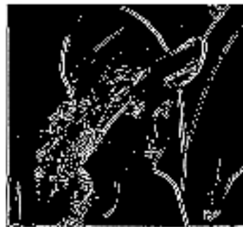
Fig. 3. Edge extraction when M = 2, k_0 = 63, l_0 = 63 .