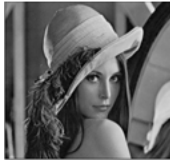
Fig.1. The original image.

The SSA method is derived from the SD-DFT, and it is an improvement of the SD-DFT. So we can use the error analysis method presented by Mitra (1990b) to calculate the error of the image processing of 2D-SSA. 2D-SSA method is very economical in time consumption, time is reduced by 2^M \times 2^M . At the same time, the error of this method in image processing is also bearable, and this is verified by the example.