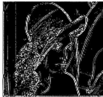
Fig. 2. Edge extraction when M = 1, k_0 = 63, l_0 = 63 .